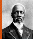
Anténor Firmin Political Action