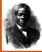
Edward W. Blyden Panaf. theorician