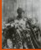
Ménélik II Ethiopia