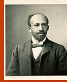
W.E.B du Bois